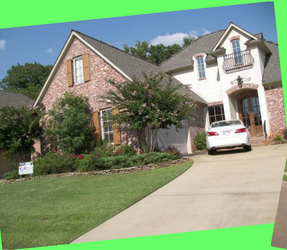
August – 274 Brisage Boulevard Peggy and Buzz Gray