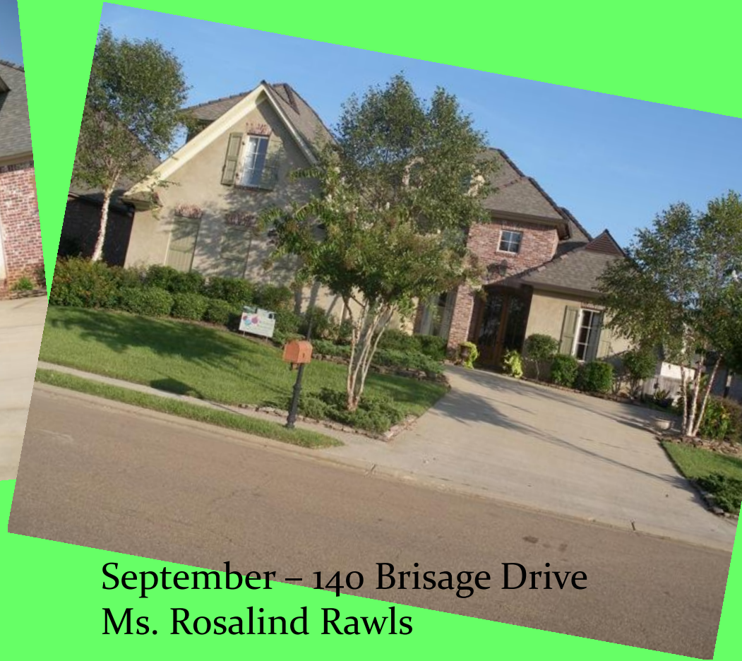
September – 140 Brisage Drive Ms. Rosalind Rawls