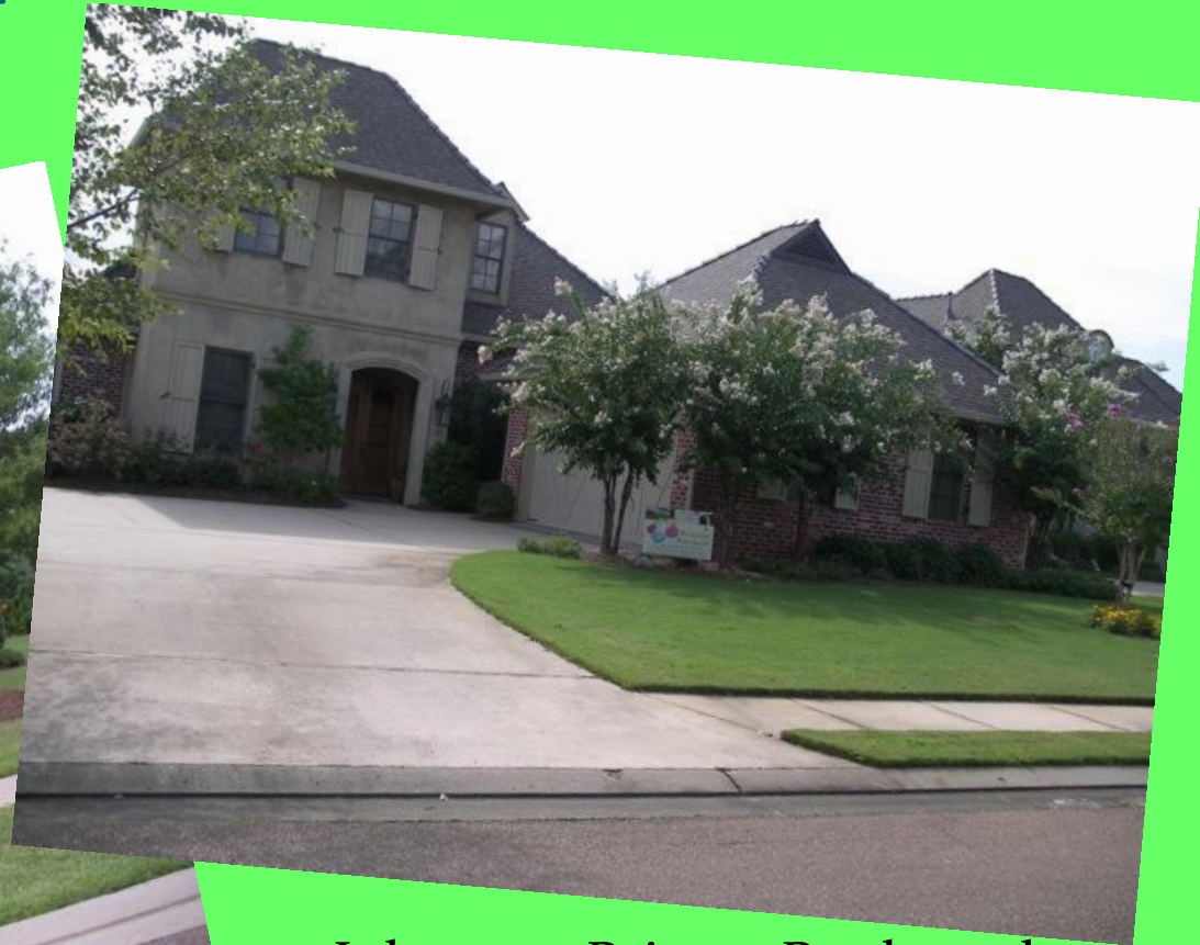
July – 245 Brisage Boulevard Isabelle and Bill Higbee